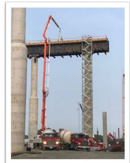
HRB Pier 19