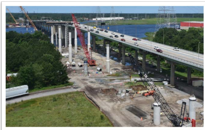
HRB Looking West