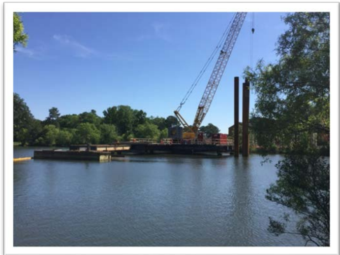
Constructing Work Trestle