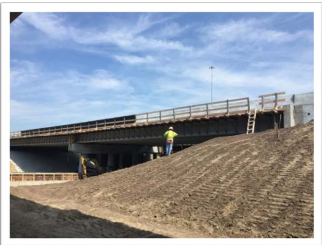
B-604 Over Kempsville Road Nearing Completion