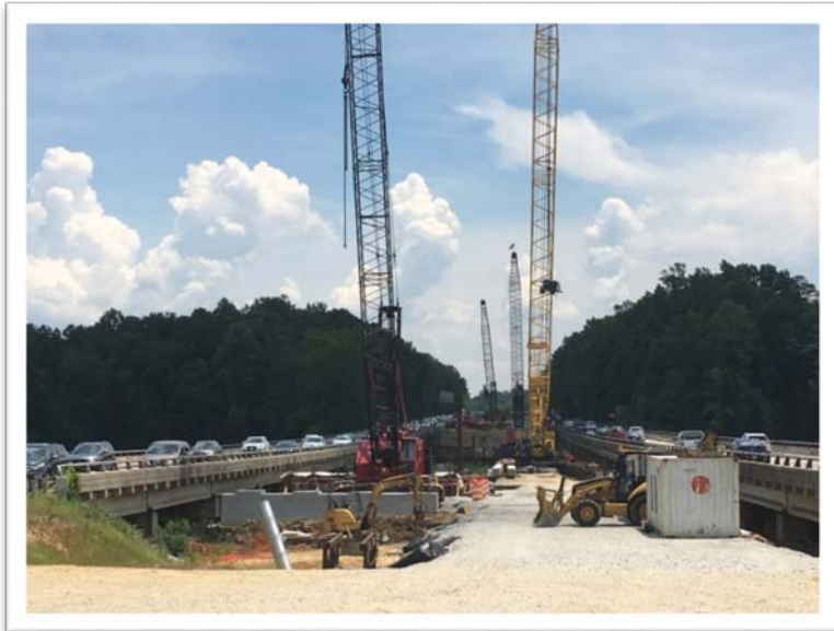
Bridge construction at the west abutment of Queens Creek