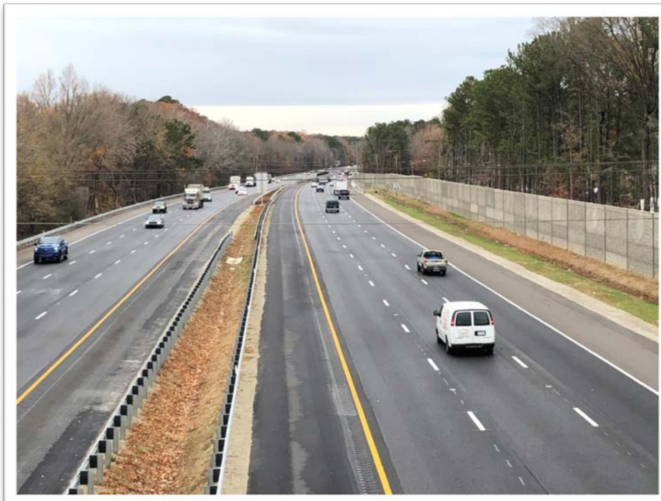
Project Site (Looking West from Denbigh Blvd.)