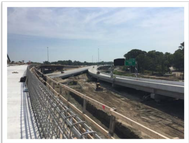
B-602 (fore ground) with B-605 C-D Road and B-603 Connector