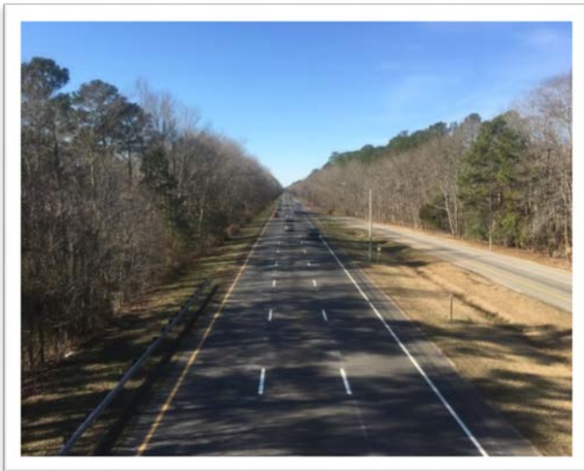
Existing facility looking westbound from weigh station