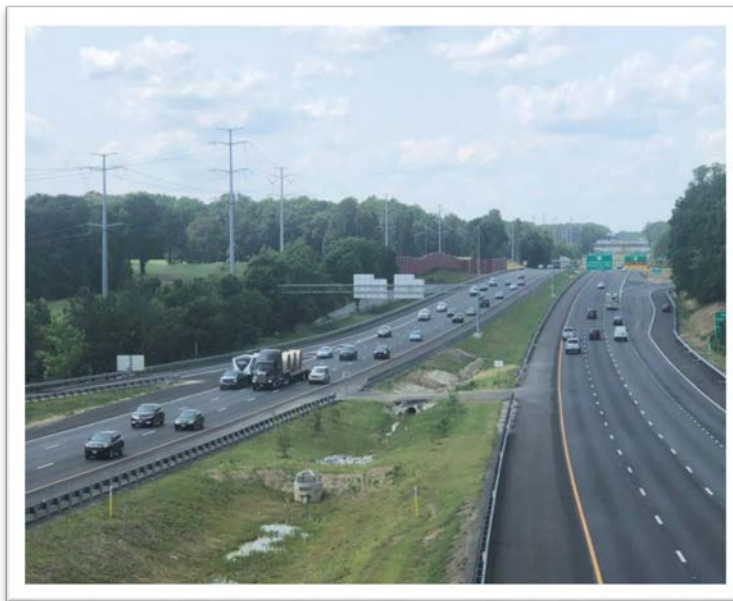
Project Site (Looking East from the Rt. 199 overpass)