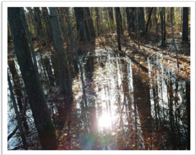
Wetland south of eastbound lanes near Sondej Avenue