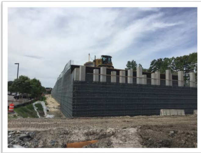
Top Golf Approach to B-603 I-264 Flyover